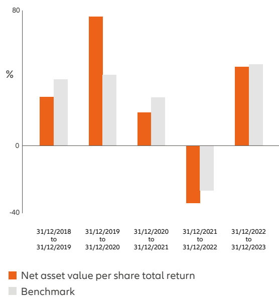
NAV return vs benchmark

Performance data to 31 December each year. Total return with net income reinvested. Past performance does not predict future returns.